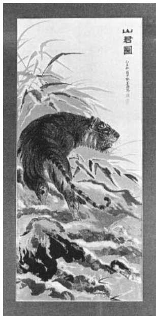
Fig. 7.5. Wall hanging presented to the Society by the Chinese Delegation attending the Oxford Meeting in 1982.

covered their accommodation costs during their stay in the U.K. The Society, in its turn, sent eight delegates to attend a very large meeting of the Japanese Biochemical Society in October 1982. Apparently 4600 members, out of a total membership of 9000, attended the meeting. The U.K. delegates reported that their hosts' hospitality was on an equally generous scale.